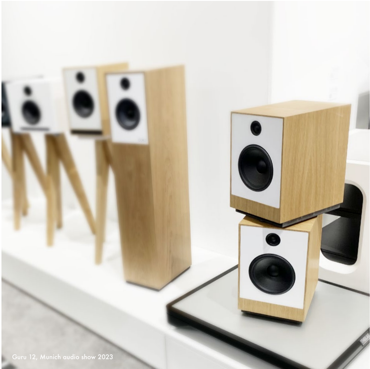
Guru 12, Munich audio show 2023